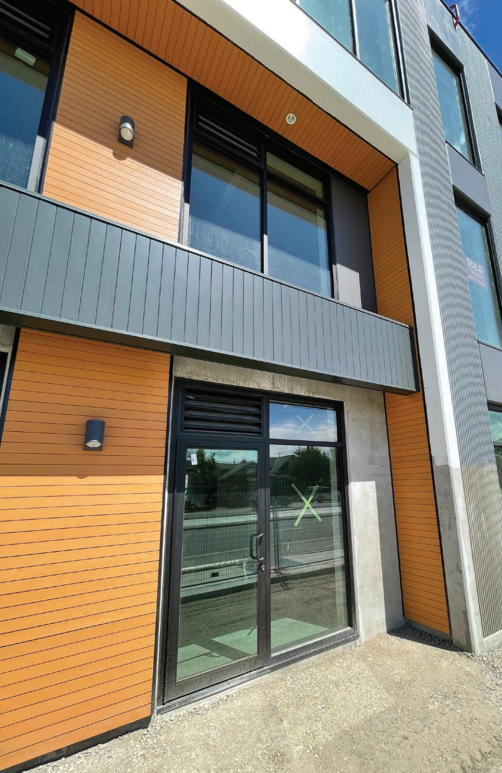
CLEMENT AVENUE ENTRANCE