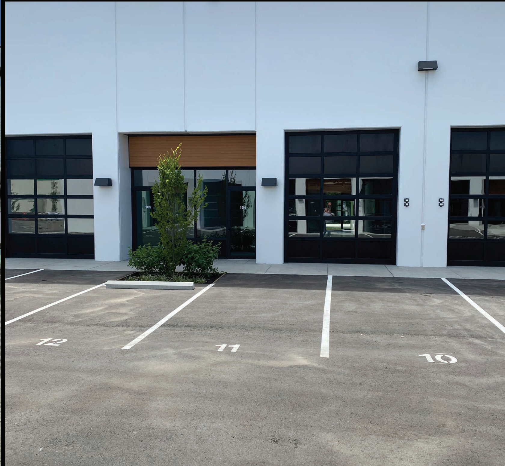
PARKING LOT ENTRANCE