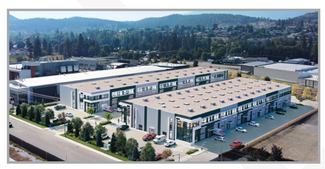
IntraUrban McCarthy - looking northwest toward Highway 97.

Kelowna is the fastest growing metro area in Canada. As the economic engine of the BC Interior, the city has become the go-to destination for business owners who recognize Kelowna's unique combination of attractive lifestyle, competitive costs, and strong entrepreneurial culture.