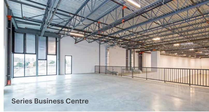
Series Business Centre

3 Selling both your business & the facility together.