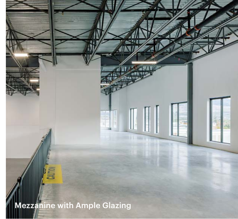
Mezzanine with Ample Glazing

As an owner at Stratosphere, Beedie will be there to support you every step of the way, creating a seamless experience to meet your property needs, leaving you free to focus on your business.