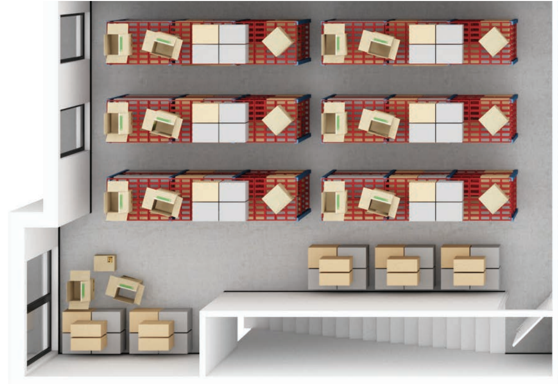
Upper Floor - Mezzanine

Additional office or showroom space can be custom-built to your specifications in collaboration with Wesmont Group.