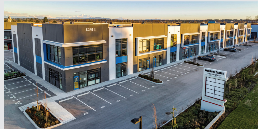
119,887 sf over three buildings Wesmont Centre