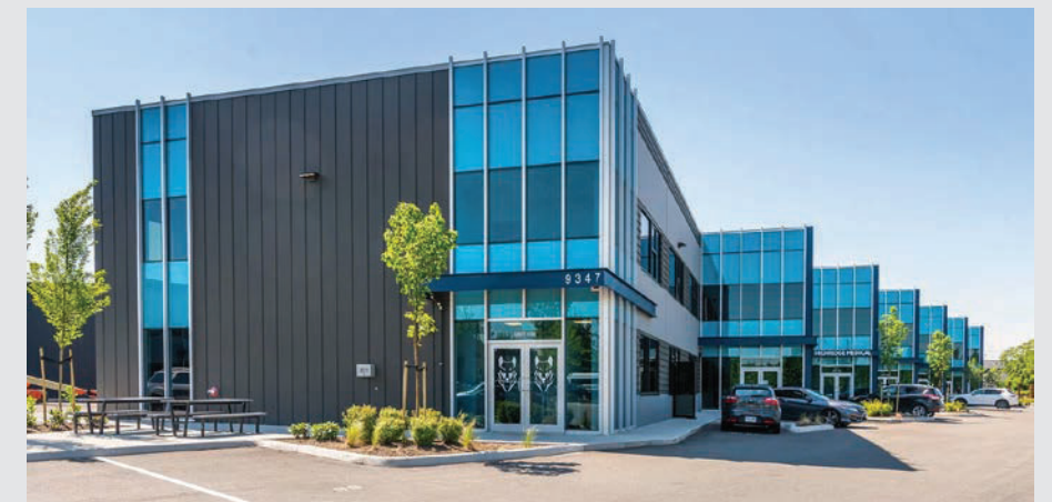
82,472 sf over two buildings Port Kells Centre