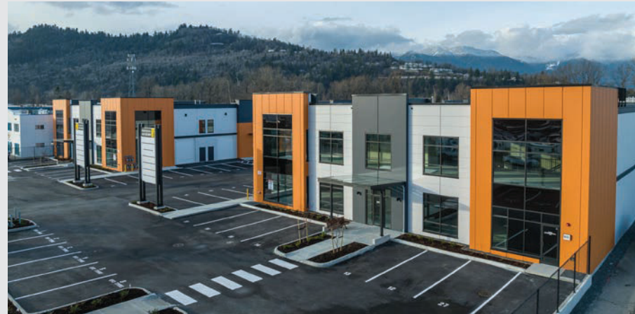
64,572 sf over two buildings Wesmont Yale Centre