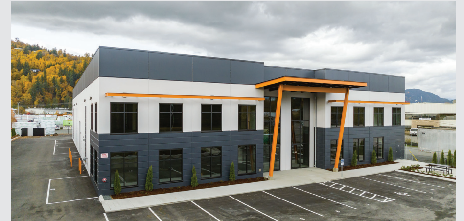
21,386 sf industrial building 8085 Aitken Road