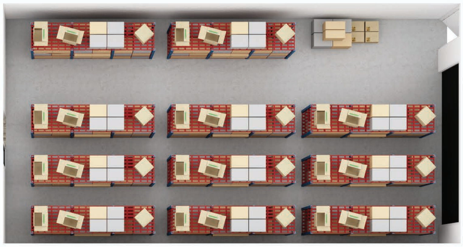
Ground Floor - Office & Warehouse